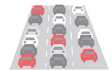
Cars: 28 people / city block

a. To help meet these goals, the City has started by targeting the areas of greatest transit delay and transit service levels. Central City in Motion is Portland's plan for strategic investments in our streets to create a smart, 21st century transportation system in the central city. The Portland Bureau of Transportation (PBOT) will complete three Central City in Motion transit investments over the next 18 months, adding 1.54 miles of bus-only lanes in the Central City. These projects will provide more reliable bus rides for the 75,000+ riders who use these lanes every day (40% of the daily rides in our transit system). The impact won't just be felt in downtown, but across the entire bus network as vehicles move more easily through the central city. The Central City in Motion projects will also