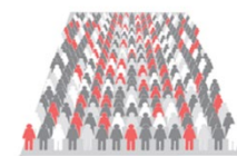
Walking: 1000 people / city block