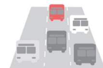
Buses: 225 people / city block